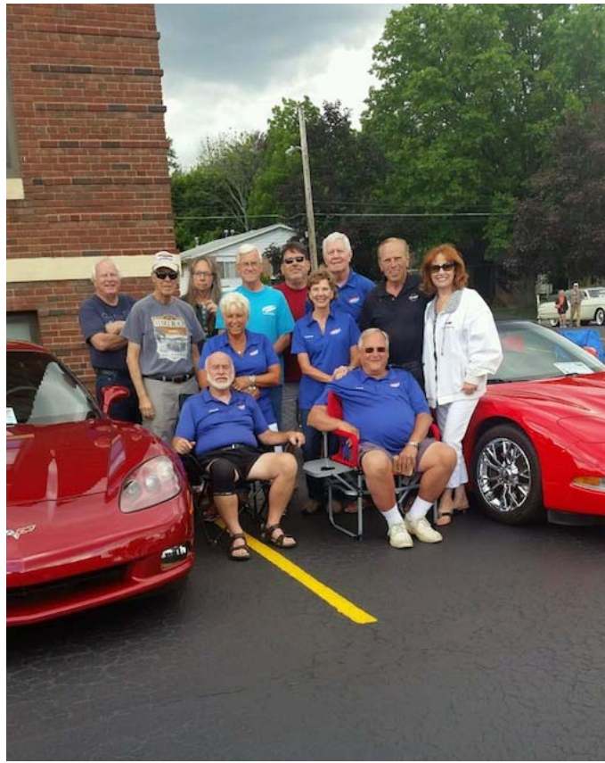
Monday, June 26 at the Front Street Cruise In – Cuyahoga Falls