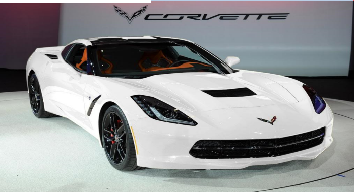
1967 to 2017