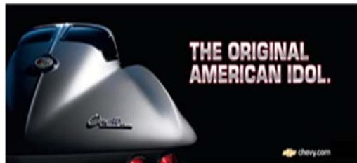
Chevrolet trademark(s) used with the written permission of General Motors.